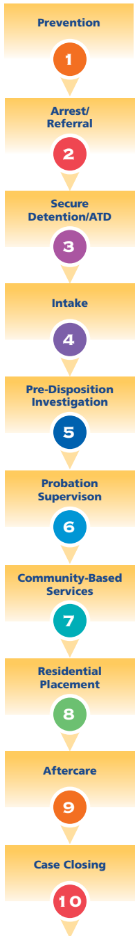
Figure 4: Ten Key Decision Points in Juvenile Justice

One way to examine the nexus between BARJ and the JJSES is to explore the activities conducted at each of ten critical juvenile justice system decision points, shown in Figure 4. While there are many considerations to take into account at each of these decision points, advancing the goals of balanced and restorative justice is the chief motivating factor throughout. This focus on BARJ will prompt the juvenile justice stakeholder to ask a series of questions such as the following: What risk does the juvenile pose and what action must be taken, if any, to manage and minimize risk? Is there an identifiable victim? What harm has been caused? What is necessary to restore the victim? What competency development skill areas need to be addressed to move the juvenile toward a law-abiding and productive lifestyle?