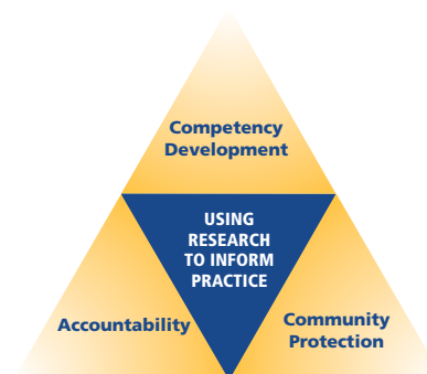
Figure 1: Integration of BARJ and JJSES