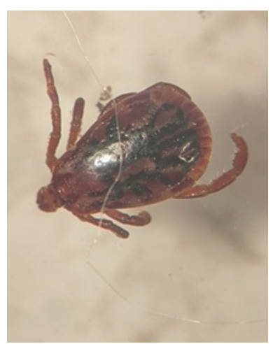
Male American Dog Tick under microscope

There is currently not much to report on the 2023 Tick season. Only 10 Black-legged Tick nymphs were collected, one of which tested positive for Lyme Disease. Adult Black-legged Ticks are still being collected in Franklin County and no test results have been returned yet. Franklin County was asked to Pilot a tick project which started in 2023 and will continue into 2024. The main goal of this project is to get more stakeholders and members of the community involved.