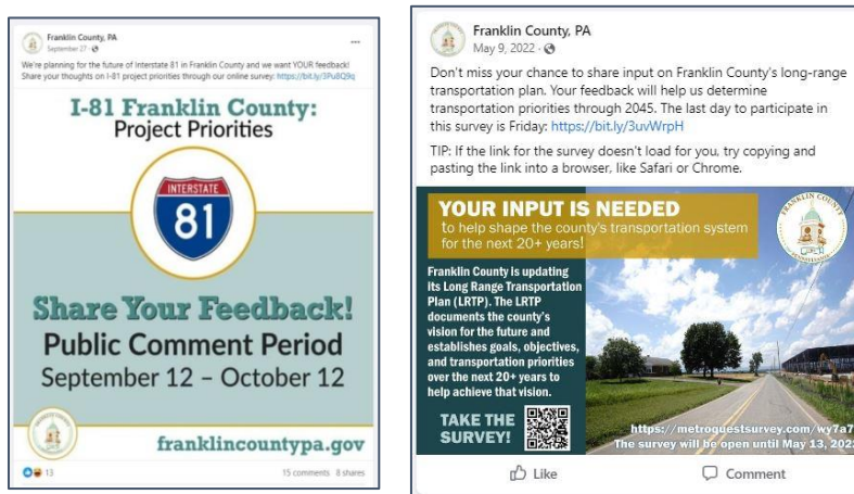
Figure 3 - FCMPO Facebook Posts

Figures 3 provides examples of the Franklin County Facebook page and its application to solicit public input on the FCMPO’s draft LRTP and I-81 Project Priorities.