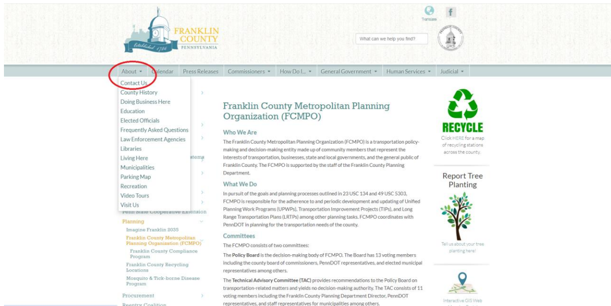
Figure 4 – Franklin County Website’s “Contact Us” Link

Franklin County Planning Department staff routinely use graphics to augment the written information included in the FCMPO’s technical studies and reports. Example graphics include, but are not limited to, flow charts, infographics, photos, visualization techniques, and text boxes in narratives.