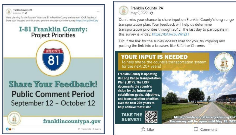
Figure 3 - FCMPO Facebook Posts

Figures 3 provides examples of the Franklin County Facebook page and its application to solicit public input on the FCMPO’s draft LRTP and I-81 Project Priorities.