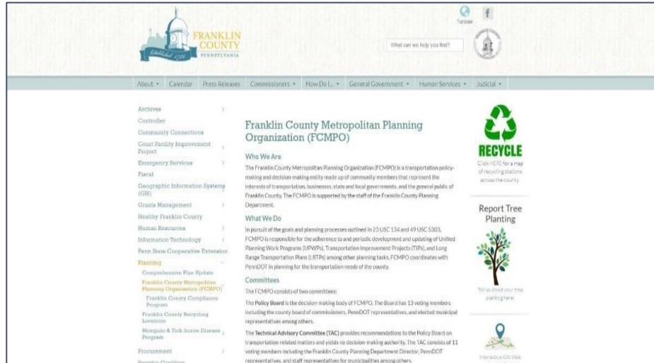
Figure 2 - FCMPO Webpage

The FCMPO’s activities and programs are designed to meet the preferences and needs of the public. Activities and programs might include presentations, discussions, various venues for meetings and forums, information on the FCMPO webpage of the Franklin County website ( Figure 2 ), Franklin County Facebook page ( https://www.facebook.com/franklincountypa ), flyers, emails and other notifications.