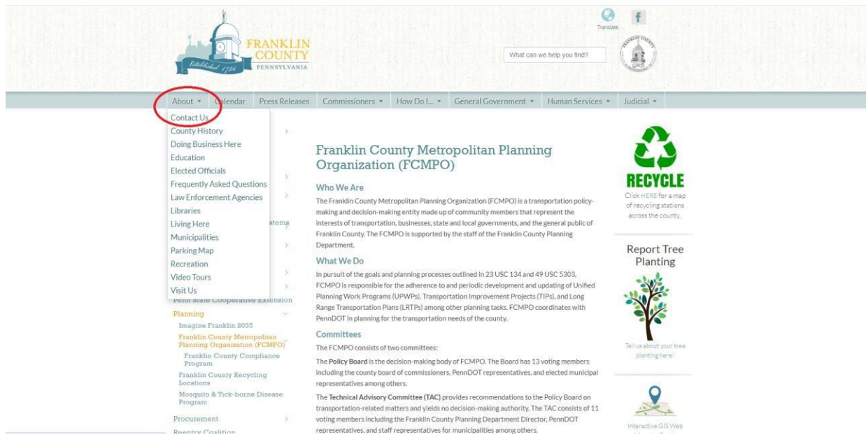
Figure 4 – Franklin County Website’s “Contact Us” Link

Franklin County Planning Department staff routinely use graphics to augment the written information included in the FCMPO’s technical studies and reports. Example graphics include, but are not limited to, flow charts, infographics, photos, visualization techniques, and text boxes in narratives.