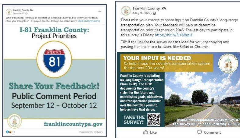
Figure 3 - FCMPO Facebook Posts

Figures 3 provides examples of the Franklin County Facebook page and its application to solicit public input on the FCMPO’s draft LRTP and I-81 Project Priorities.