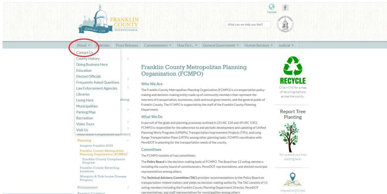
Figure 4 – Franklin County Website’s “Contact Us” Link

Franklin County Planning Department staff routinely use graphics to augment the written information included in the FCMPO’s technical studies and reports. Example graphics include, but are not limited to, flow charts, infographics, photos, visualization techniques, and text boxes in narratives.